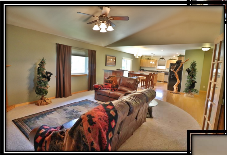
Kitchen/Dining & Living Room