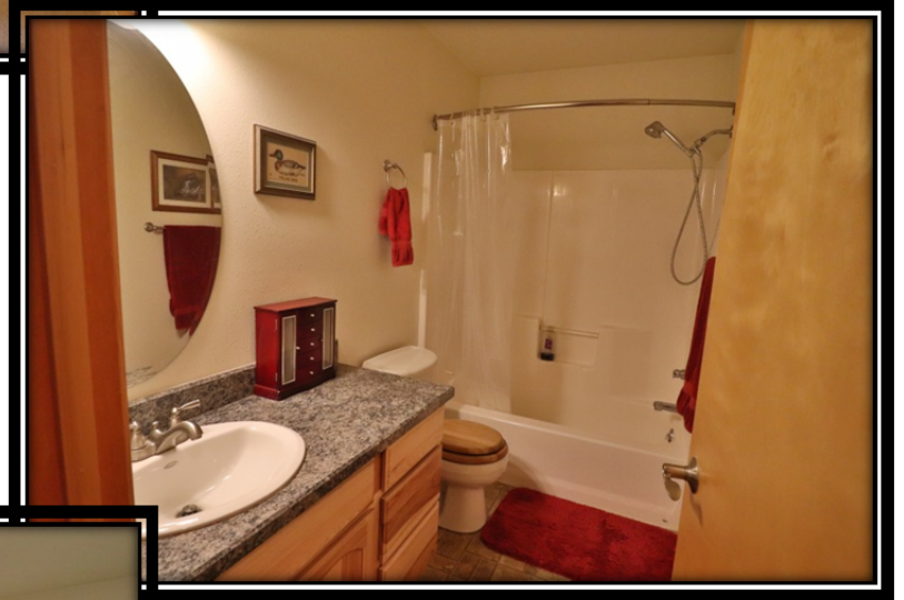
2 nd Full Bath