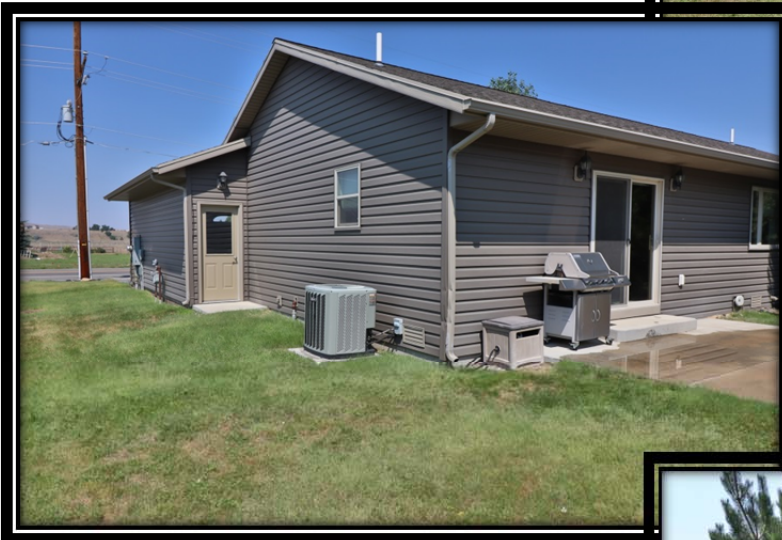
Back & Side